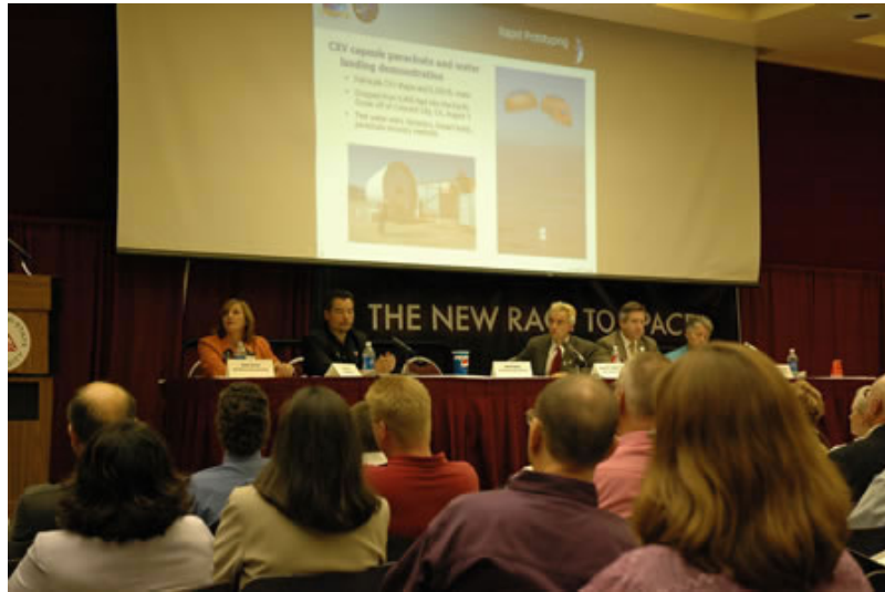
Track 2- The Personal Spaceflight Experience