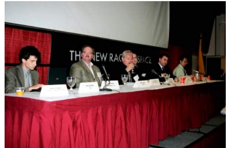
X PRIZE Competitor Panel